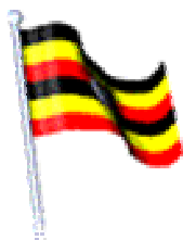
Being in Uganda was much more than just a cultural experience.

Altar calls were challenging; the team alternated laying hands on people and swatting bugs.