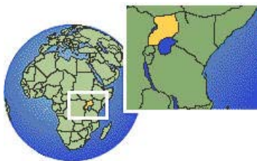
Mission trip to Uganda, Africa.